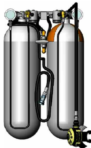
XBS Assembly (plastic case is hidden)