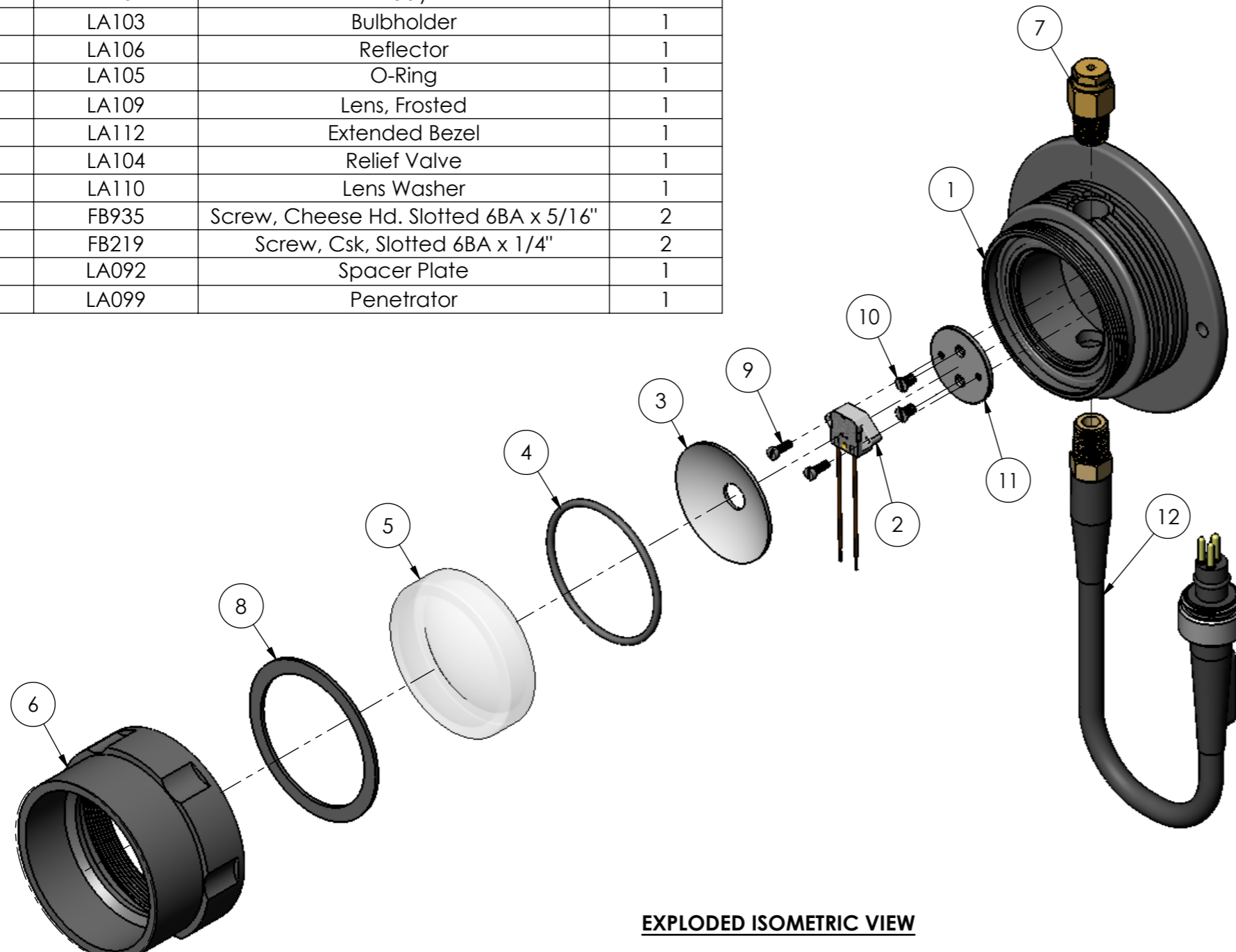
EXPLODED ISOMETRIC VIEW