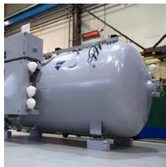
Pre and Post-Refurbishment Chambers by JFD