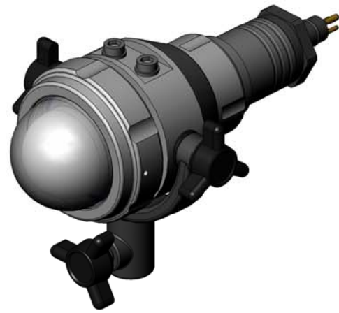
ASSEMBLED ISOMETRIC VIEW